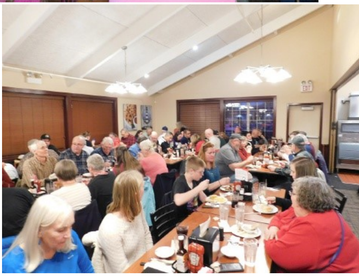
More Photos on the club website—home page