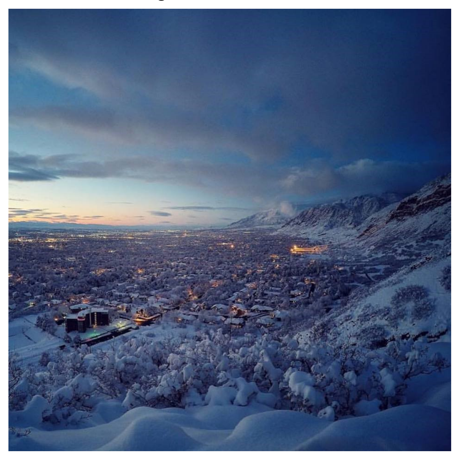
Ogden Utah, Weber County