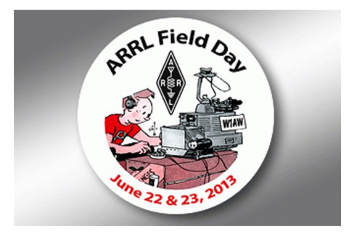
Field Day 2013

The results of the 2013 ARRL Field Day have been posted. Less-than-ideal conditions this past June likely accounted for a slight drop in participation from 2012. Nonetheless, there were more than 2500 entries, and more than 35,500 people participated.