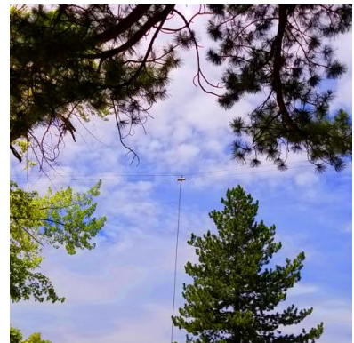
KE7DOA Field Day 2020... Alone...