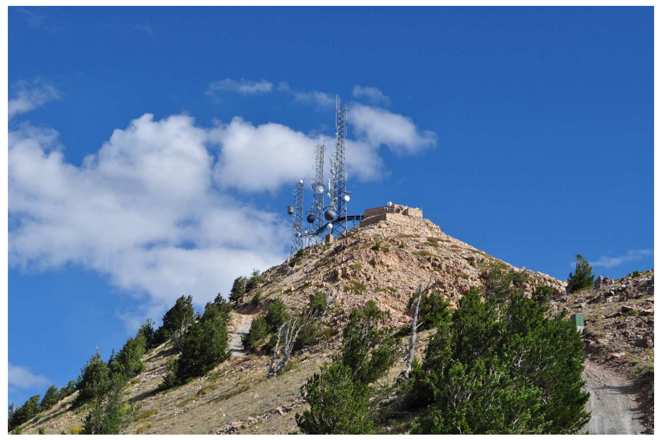
Mount Ogden Repeater Site

This is the 2nd of several pictures in a series at Mt Ogden repeater site during a recent visit to the site to do necessary repairs. Mike says the OARC antennas are on the middle tower.