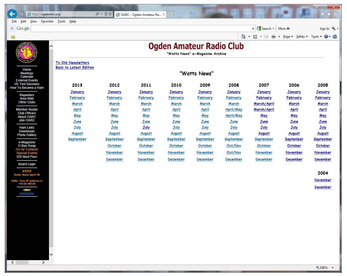
OgdenArc.org >>> left side menu >>> eMagazine >>> archive

The webpage below shows the club website eNewsletter archive page where all 108 issues are available for your viewing pleasure.