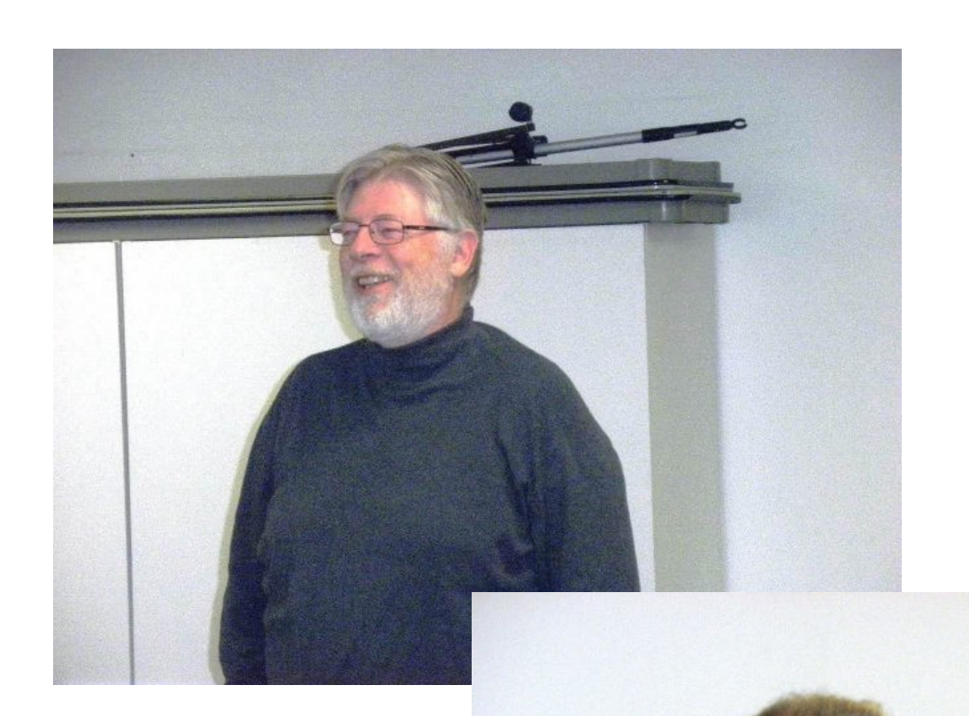
Welcome ... First Time Visitors