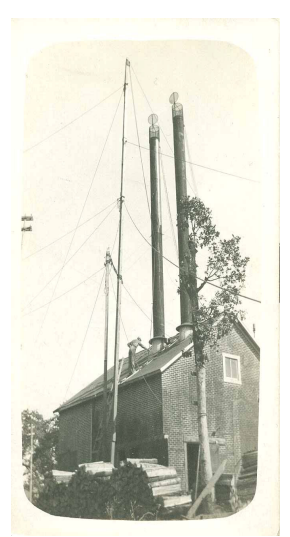
From Kim's Shack